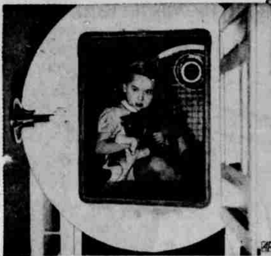
FAITHFUL TO HER PUPS — This little girl evidently wants to stay with her two bulldog pups, booked for therapeutic treatment in this newly-developed low pressure chamber at Frankfurt, Germany. Chamber, containing infra red and ultra violet ray lamps, has been used successfully in cases of animal distemper, bronchitis, rheumatism and skin diseases.

It has been surfaced with a rock base, but will not be given a final oil surfacing until spring. Opening of the highway is expected to aid movement of lumber from sawmills at Mitchell, 50 miles east of Prineville.