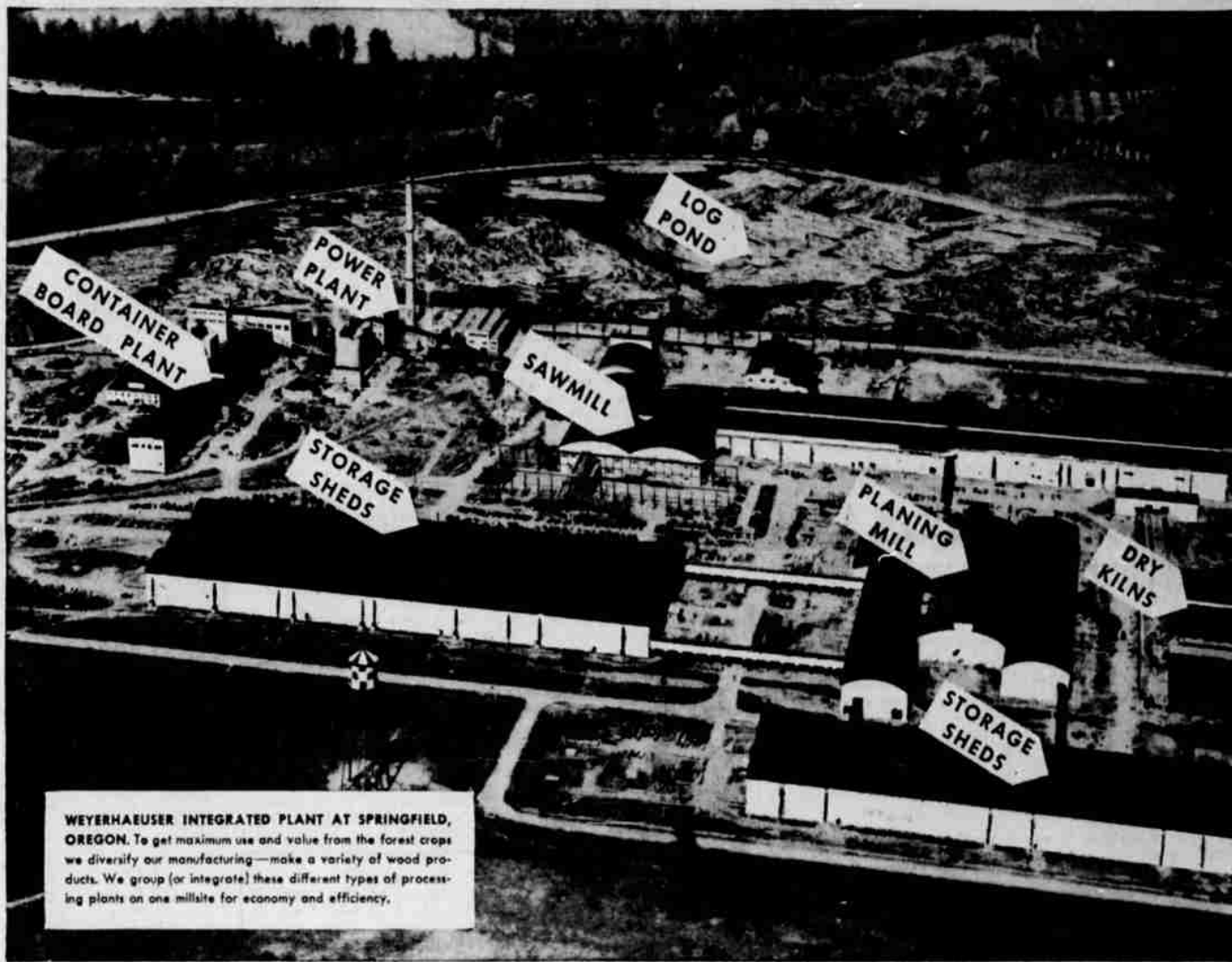
WEYERHAEUSER INTEGRATED PLANT AT SPRINGFIELD, OREGON. To get maximum use and value from the forest crops we diversify our manufacturing—make a variety of wood products. We group (or integrate) these different types of processing plants on one millsite for economy and efficiency.

OIL HEATERS & BATHROOM FIXTURES BUY AT Douglas Hardware 906 S. Stephens Phone 964-J