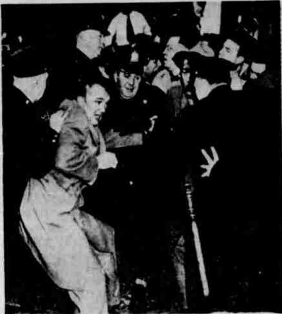
POLICE REMOVE PICKET —Police remove a telephone equipment workers' picket during a melee with strikers in front of the Bell Telephone exchange at Philadelphia, Pa.

Supplies sent to Yugoslavia by the western nations, he said, "will be distributed with the utmost care and economy and special precautions will be taken that none of it is squandered."