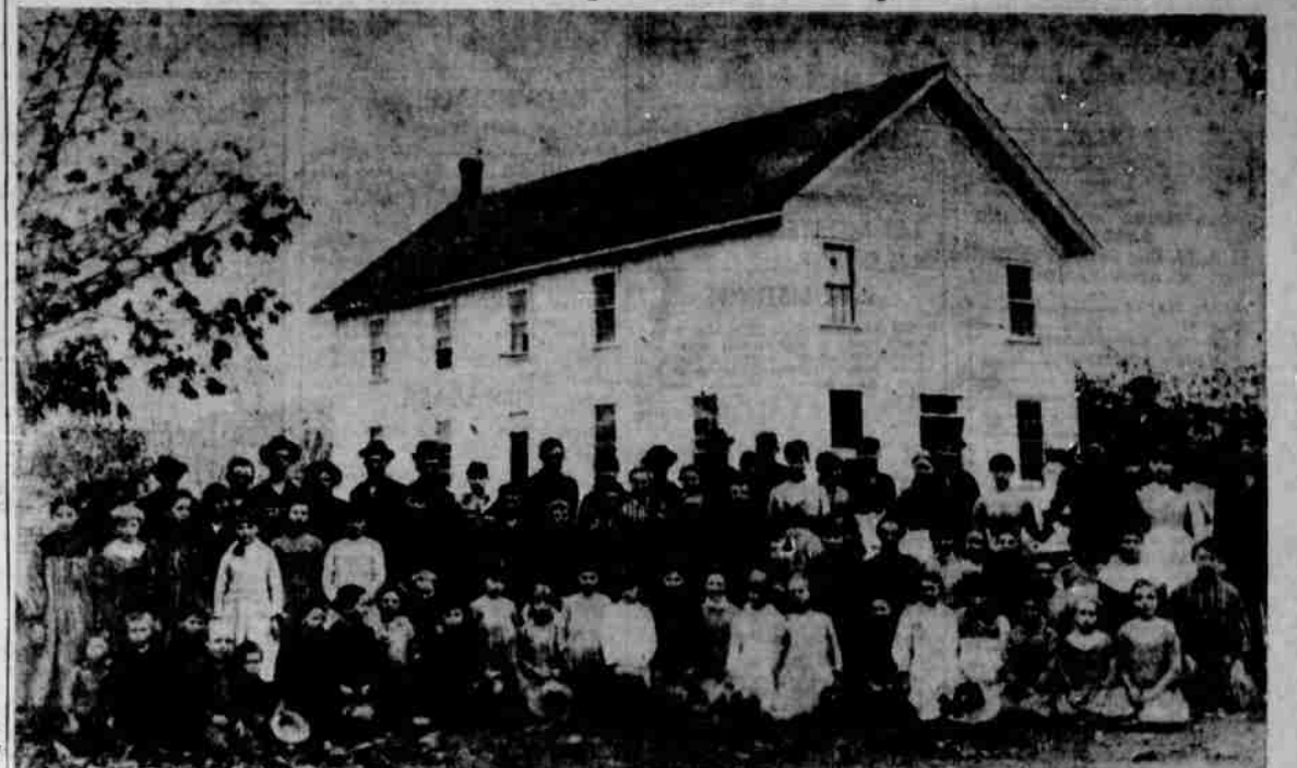
EARLY DAYS RECALLED —This was Lookingglass school in 1889. The building was considered a "fine" structure, consisting of two stories. Nearly 100 pupils attended. The second floor was used for community dances and other entertainment. Early days at Lookingglass are being recalled by the Parent-Teachers association, which is sponsoring a "Gay 90's Review" the nights of Nov. 17-18 at the Lookingglass school.