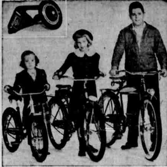
BIKES FOR ALL SIZES—The new 1951 model bicycles, on the market for the Christmas trade, are as bright, shiny and up-to-date as the new automobiles.