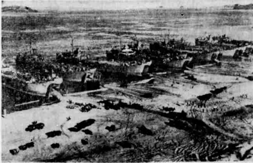
KEEPING OUR TROOPS SUPPLIED—Ten LST's line up on the beach at Wonsan, Korea, to unload supplies and men. A steady flow of equipment is keeping the United Nations forces supplied for the fighting in Korea.

suddenly this morning at his home. Funeral arrangements will be made later by Stearns mortuary of Oakland.