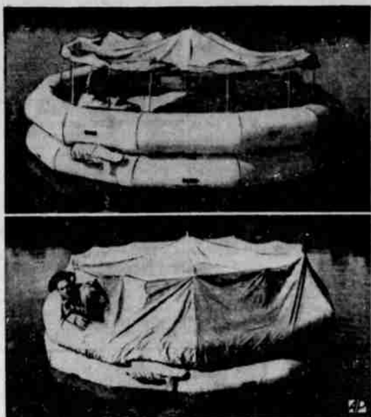
FLOATING 'CIRCUS TENT'—This new 20-man life raft, developed by Air Force's Air Materiel Command at Dayton, Ohio's Wright-Patterson Air Force Base, can support more than 5,000 pounds without sinking.