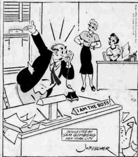
He's telling someone else what he didn't have the nerve to say to his wife.