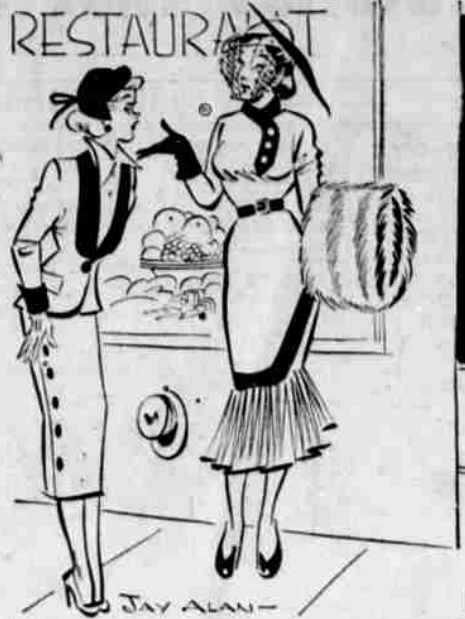
EVERYTHING'S GETTING SO HIGH PRICED WE'D BETTER CUT DOWN ON NON-ESSENTIAL THINGS LIKE EATING!