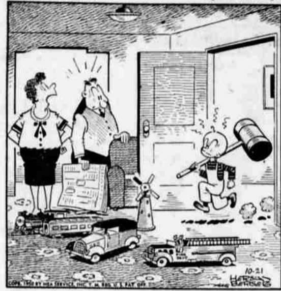
"Maybe we shouldn't have told him they were unbreakable toys!"