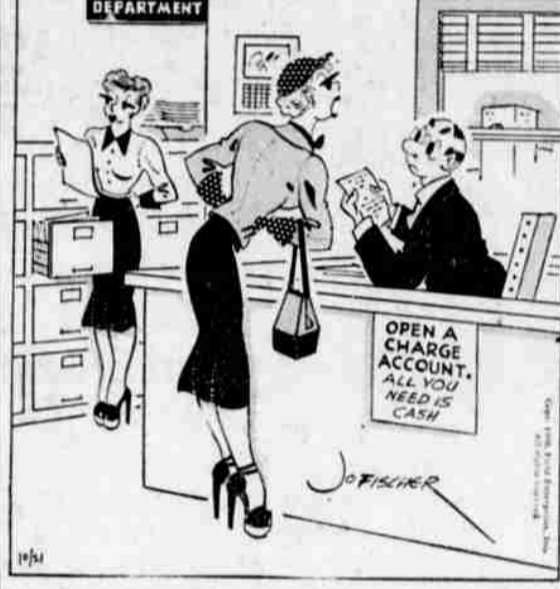
OF COURSE I have a credit rating! I'm blacklisted all over town!