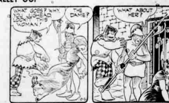
WHAT GOES? WHY YOU LIGHTS? THE DAME?