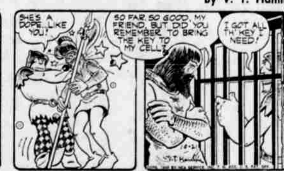
SO FAR SO GOOD, MY FRIEND, BUT DID YOU REMEMBER TO BRING THE KEY TO CHILL?