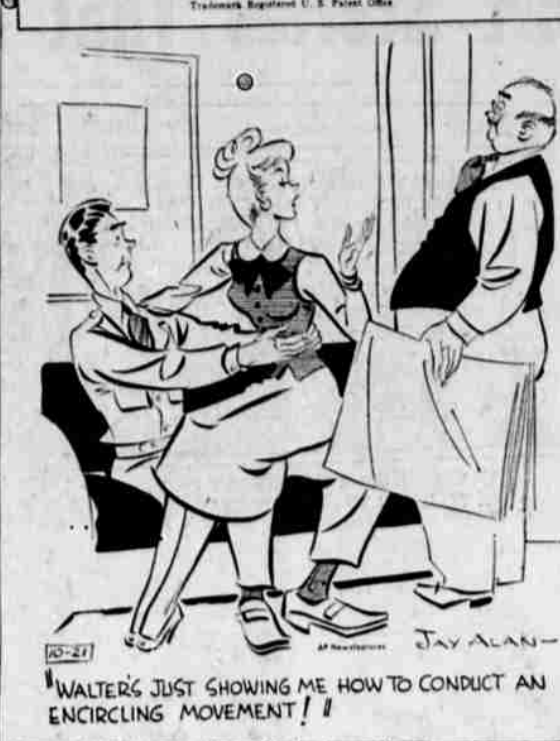
WALTER'S JUST SHOWING ME HOW TO CONDUCT AN ENCIRCLING MOVEMENT!!