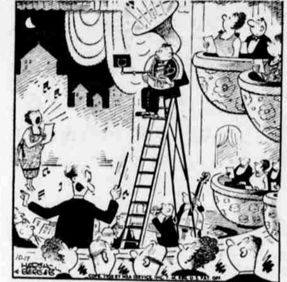
"People in the boxes were always dropping things into this tub!"