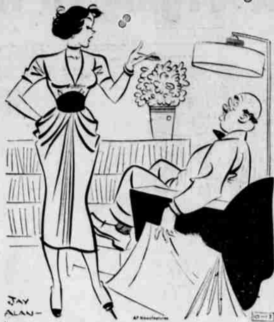
SO YOU LIKED ME BETTER AS A RED HEAD, WELL I LIKED THE COLOR YOUR HAIR USED TO BE, BETTER TOO.