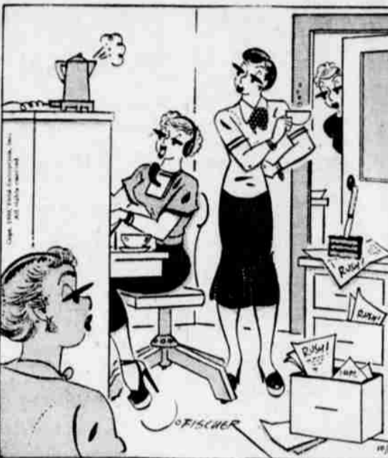
I'm sorry you're home sick, Mr. Wump, but don't worry. We'll neglect everything just as conscientiously as if you were here.