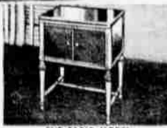
END TABLE MODEL