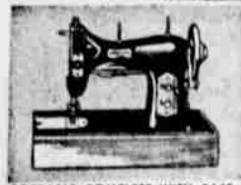
PORTABLE COMPLETE WITH CASE