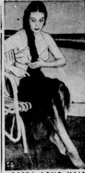
OPERA LONG HAIR—Blanche Thebom, mezzo-soprano of New York Metropolitan and San Francisco Opera Companies, combs her five-foot-long locks beside a pool in Hollywood.