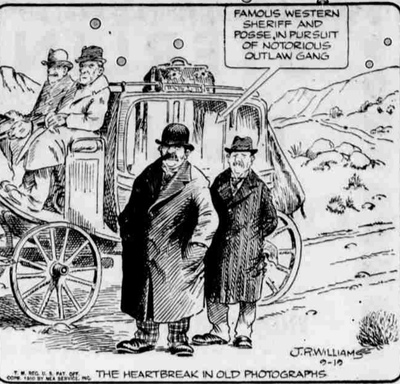
FAMOUS WESTERN SHERIFF AND POSSE IN PURSUIT OF NOTORIOUS OUTLAW GANG

KEEL MOTOR COMPANY 443 N. Jackson Phone 129