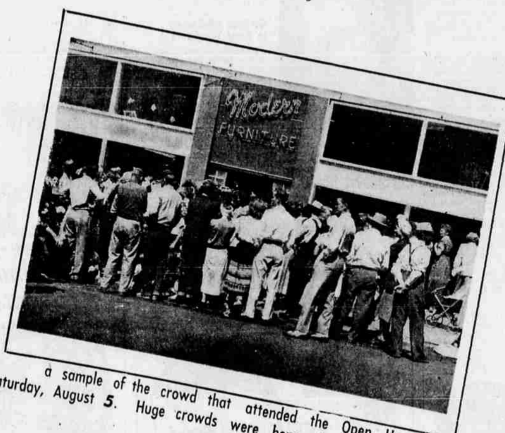
a sample of the crowd that attended the Open House Saturday, August 5. Huge crowds were here all day.

Thanks... Thanks to all you fine people who made our Open House such a grand success.