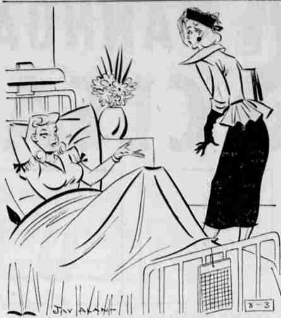
THERE'S NOTHING WRONG WITH ME, I COME TO THE HOSPITAL EVERY YEAR FOR MY VACATION.