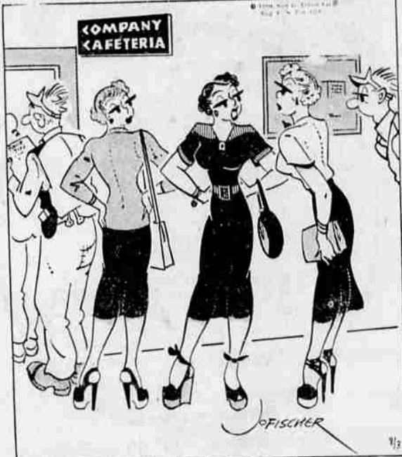
Don't ever borrow money from Deleria. She expects it back.