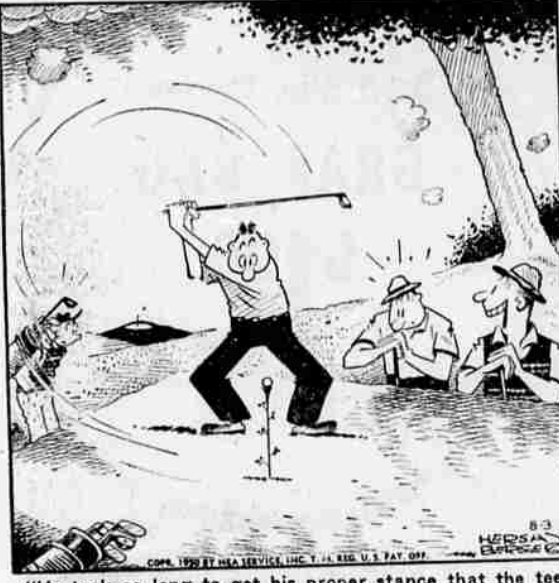
"He took so long to get his proper stance that the tee sprouted!"