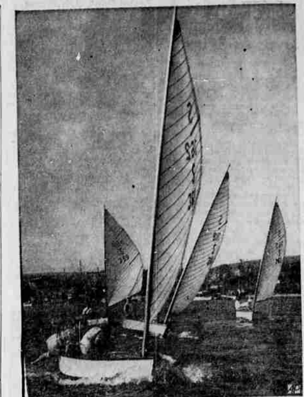
THE JUNIORS GO TO SEA —Southern California junior yachtsmen practice for the 15th annual "Flight of the Snowbirds," their own regatta in Greater Newport Harbor, Cal.

Mae Murray's comeback in a dance act at the Macambo last month, has brought her offers of