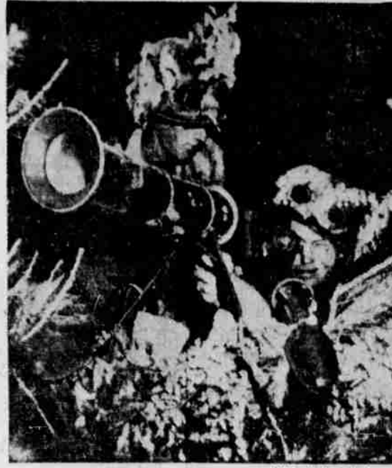
TANK KILLER —Well camouflaged U. S. troops sight a 3.5-inch rocket launcher at the battlefield in South Korea. This new and larger Bazooka is credited with stopping many of the huge North Korean tanks.