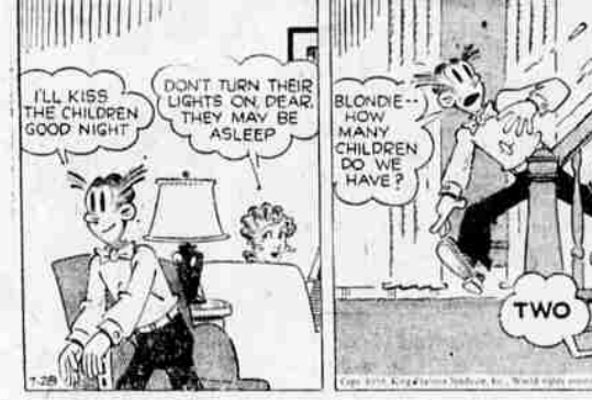
Blondie--how many children do we have?