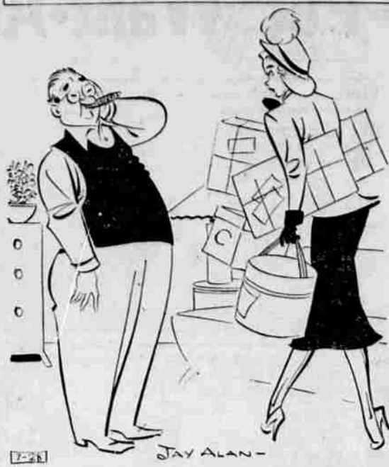
OF COURSE I THOUGHT ABOUT OUR BUDGET--- I THOUGHT I'D JUST CHUCK IT!