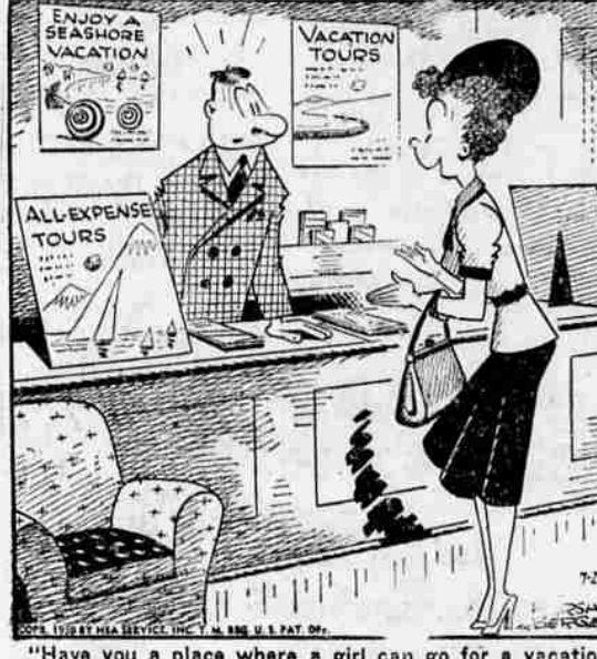
Have you a place where a girl can go for a vacation, meet nice young men, become engaged, and get back in two weeks?