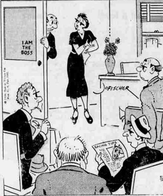
You said you wanted this afternoon free so I made all your appointments for twelve o'clock.