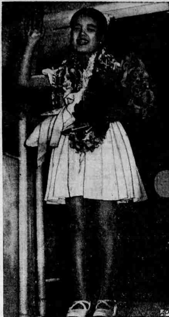
A MOVIE STAR ARRIVES —Misora Hibari, 13, idol of Japanese moviegoers, wearing leis presented by Honolulu fans, arrives at San Francisco for a series of personal appearances.