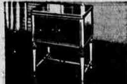
END TABLE MODEL features automatic head lift. Just lift the top and the sewing unit rises into position.