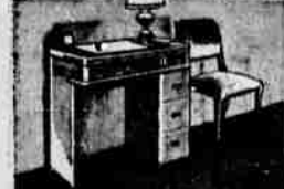
DELUXE DESK MODEL holds sewing and writing supplies. Smartly styled furniture piece you take pride in.

Women skilled in sewing or just beginning will find sewing features on a Domestic Sewmachine are designed to help them sew faster, better, and easier than ever before. See the furniture styled cabinets... try sewing on them yourself.