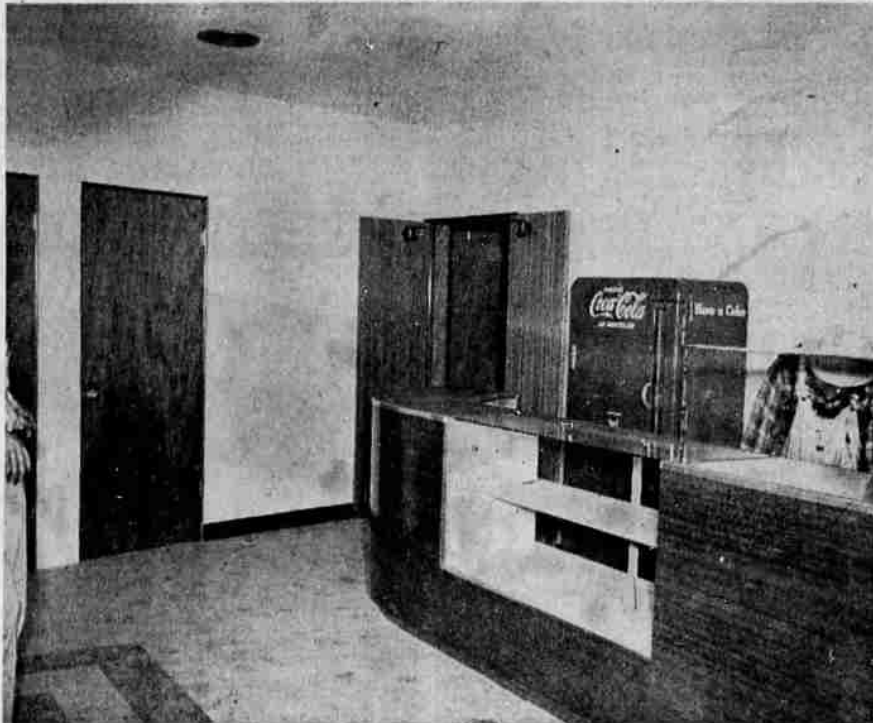
LAST MINUTE FINISHING TOUCHES are being given to the new Benetta theater, which is scheduled for opening Friday at 7 p. m. at Winston. The top picture is a view of the interior looking toward the theater screen. The lower left picture is a scene in the lobby, which will include a snack bar. The lobby woodwork, doors and cabinets are finished in mahogany.