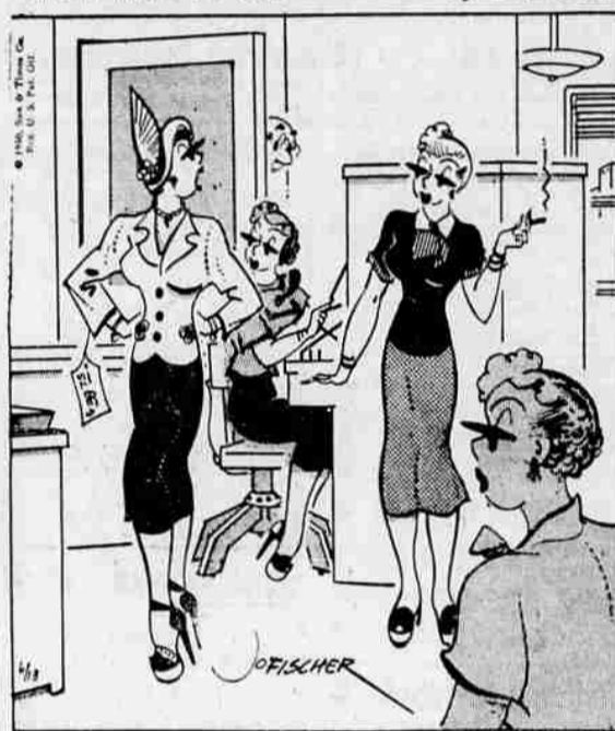
It's my new Easter outfit. I just finished making the last payment on it.