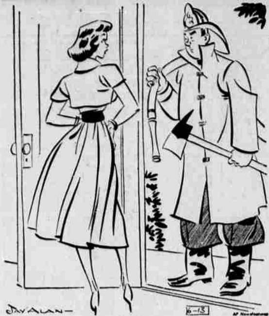
MY GOODNESS, YOU MUST BE ONE OF THOSE VISITING FIREMEN!