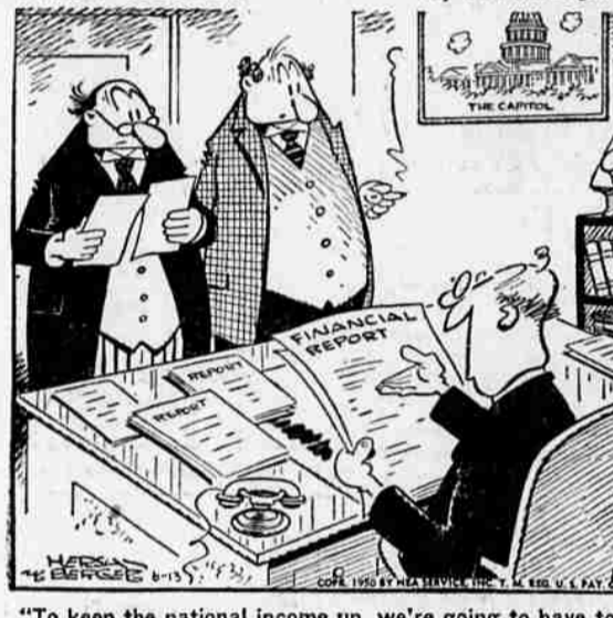
"To keep the national income up, we're going to have to keep on spending—consequently, I am suggesting building a new bridge over the Mississippi, lengthwise!"