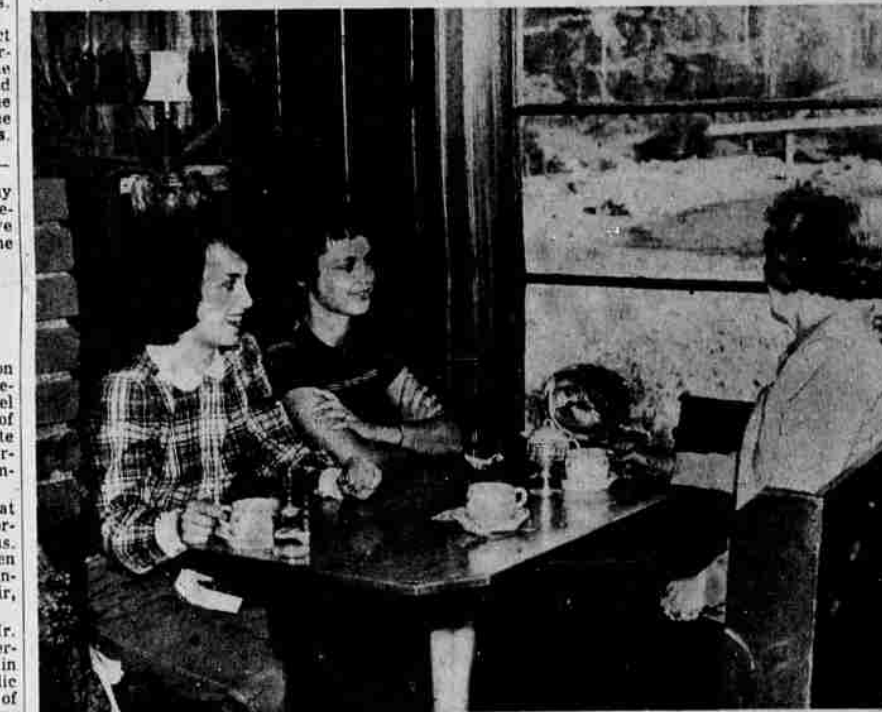
Replete after a seafood dinner, the weary models sit in a Yachats restaurant and watch the ebbing tide and the departing day as time nears for the return home. Such a good time at the beach! Must come again.