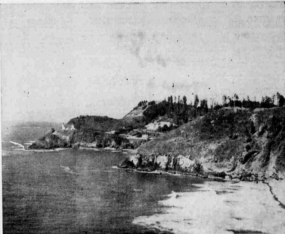
THE LIGHTHOUSE AT HECETA HEAD on the Coast highway north of Florence not only lights mariners many miles at sea but is focal point for thousands of cameras in the hands of coast visitors each summer. It is the practical southern terminus of the famous Lincoln county beaches.