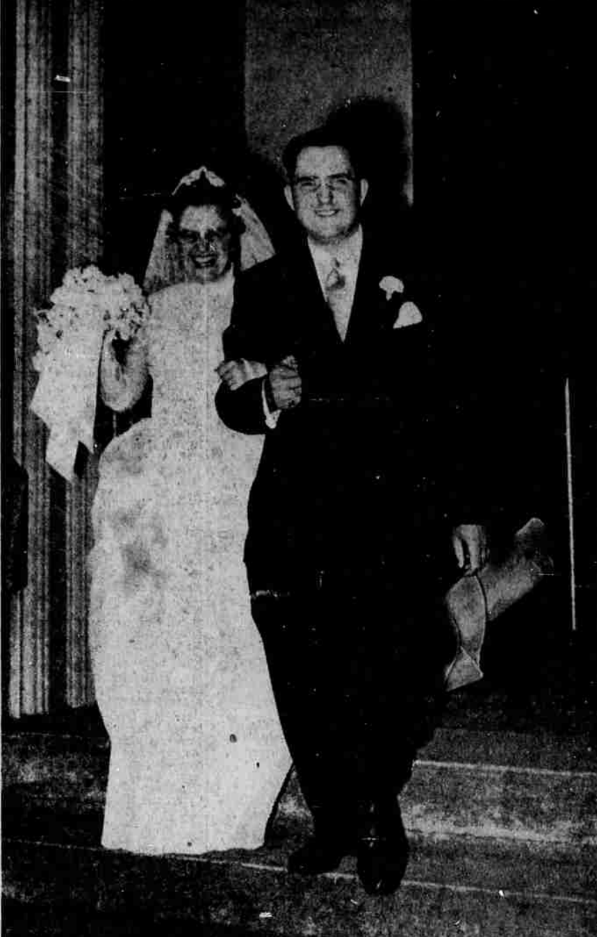
descended the church steps on the way to their wedding reception.