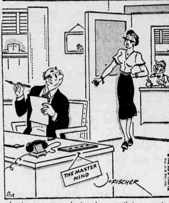
I got your message about an hour ago that you wanted to see my right away... Was it important?