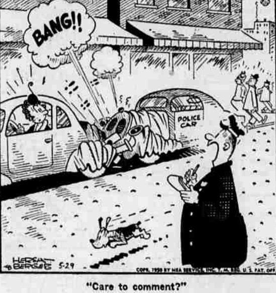
"Care to comment?"