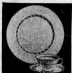
Del Monte $12.95