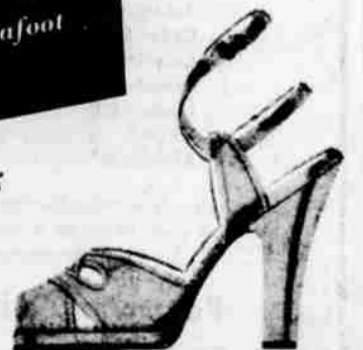
White Calf AAAA to B 12.95

Dressy whites complete your summer ensemble.