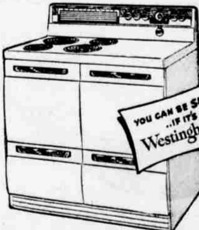
Westinghouse Electric Range Retail value—259.95

PLUS: Electric Roaster with cabinet, value—59.90