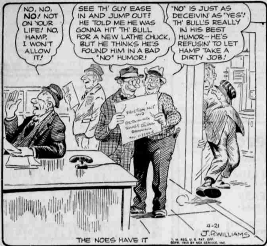
THE NOES HAVE IT