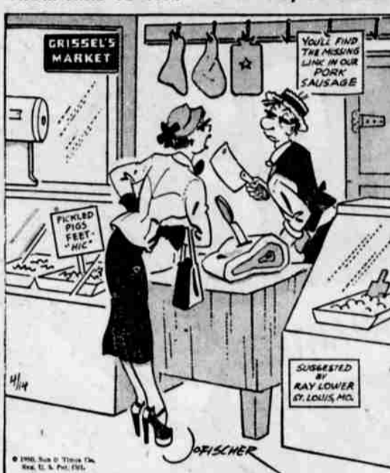
I just don't know what to make for dinner. Have you got some hamburger that tastes like something else?