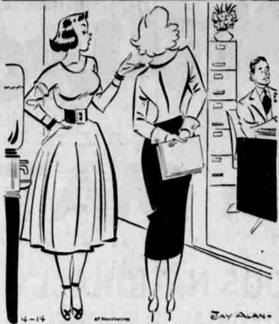
"I'M HIS GIRL FRIDAY, BUT WHAT I WANT TO BE IS HIS GIRL SATURDAY NIGHT!"