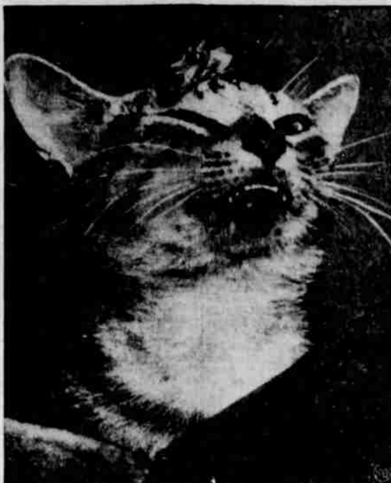
FRIENDSHIP WINS —Minnie the mother cat who lives at the railroad yards in Jersey City, N. J., evidently triumphed over her baser instincts in adopting this fearless mouse into her household. Shortly after Minnie gave birth to a litter of kittens, the wee mouse turned up and made itself at home.

cant proposal of its kind that has been offered by the CIO to the AFL and these other organizations since the CIO was originally organized." It went to AFL President William Green; John L. Lewis, president of the UMW, and to the heads of the International Association of Machinists, the Railway Labor Executives association, the Railroad Trainmen and the Brotherhood of Locomotive Engineers. "I have every reason to express the hope that a favorable reply will be forthcoming," Murray told reporters. Green's associates here indicated that they would hold to their long-time stand that the two big federations must merge before they cooperate on anything.