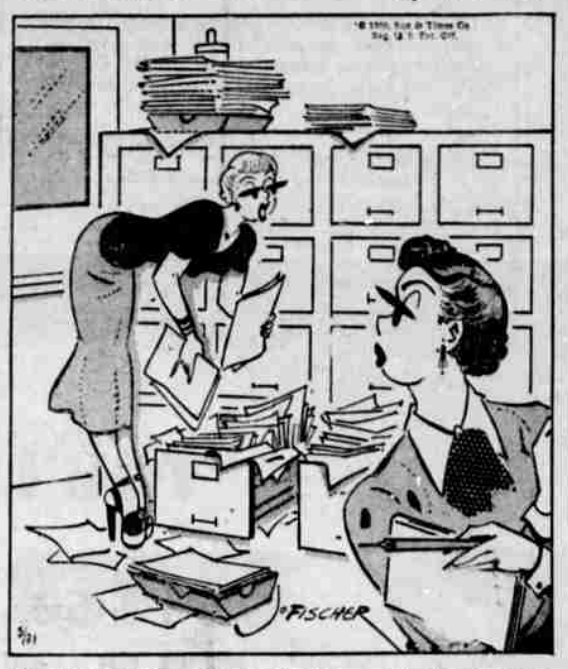
The doctor says I need more exercise . . . so I file everything in the bottom drawnrs.