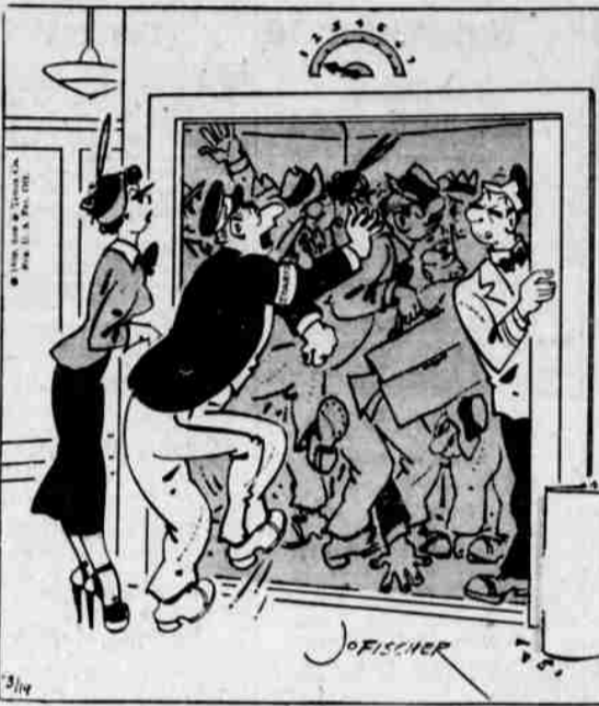
Step on top of each other in the car, please.