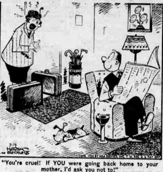
"You're cruel! If YOU were going back home to your mother, I'd ask you not to!"