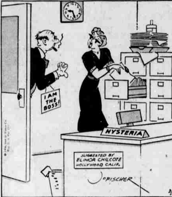
It's too early to tell yet if she'll be late or not.