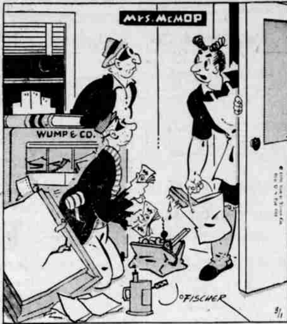
Oh, I beg your pardon. I'll come back later when you're through.