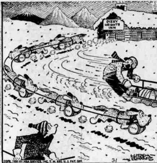
"A special customer got lost!"