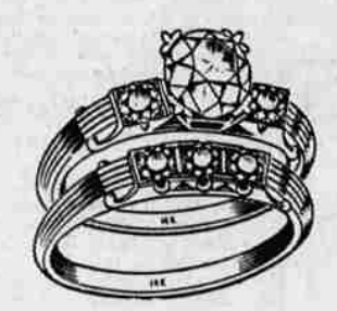
Seven sparkling diamonds, 14K gold : hings. was $150 $120

Come in to LAWSON'S now, buy the ring of your choice and save 20%. Convenient terms, of course.