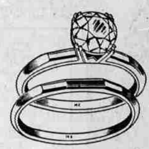
Was $75 $60