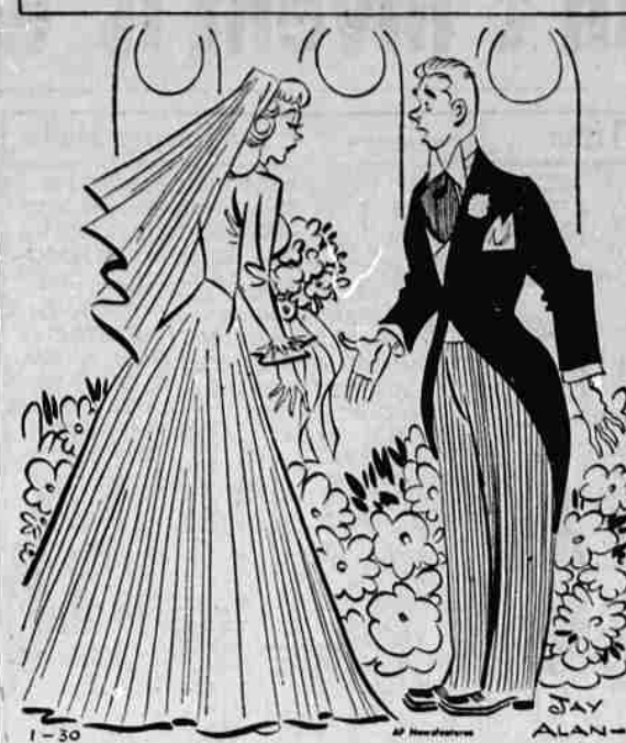
YOU CAN'T GO HOME TO YOUR MOTHER--- WE'RE NOT EVEN MARRIED YET!!