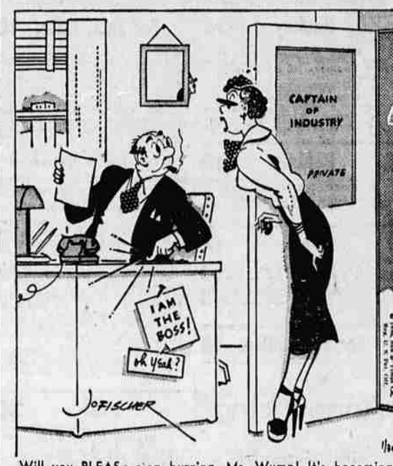
Will you PLEASE stop buzzing, Mr. Wump! It's becoming awfully hard to ignore you!