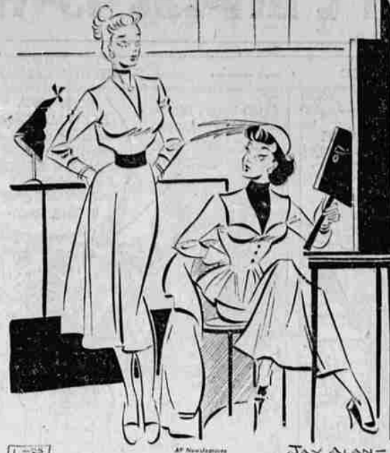
EVERYTIME I GET SOME MONEY IT GOES RIGHT TO MY HEAD!