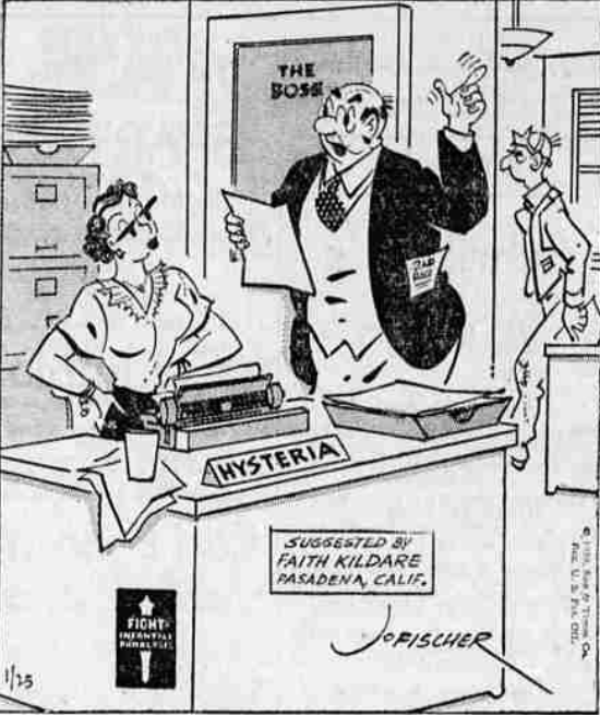
All right... so I told you to do it! But haven't you been around here long enough to know you shouldn't pay any attention to me?