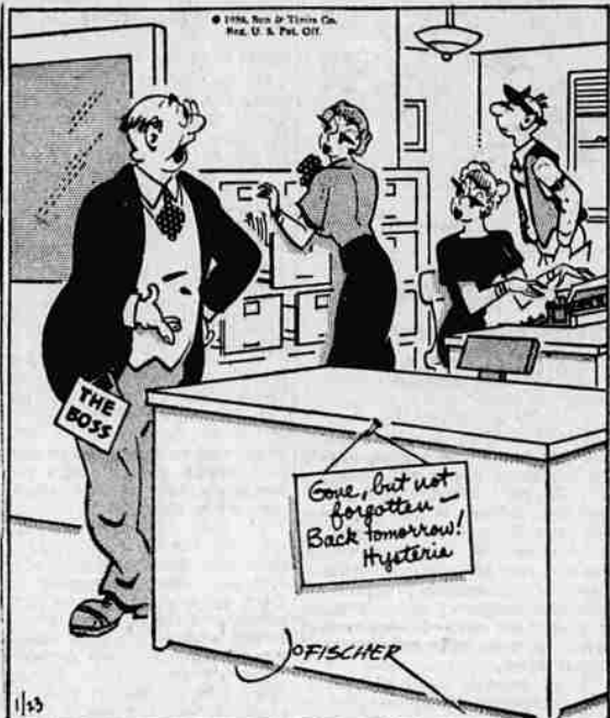
Now THERE'S a good example of disloyalty to the company. Just because I fired Hysteria, she takes the whole day off!