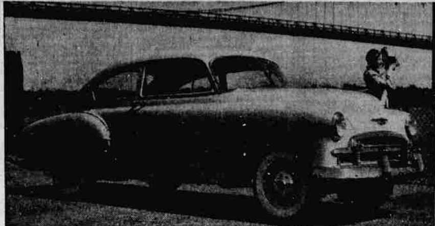
As in 1949, Chevrolet's newest line of passenger cars offers two individually designed sedans. This is the Fleetline, so described because the curvature of the rear quarters follows body lines. Its beauty in exterior and interior treatment is visible to the eye with increased power and comfort highspotting chassis improvements. In addition, the company offers an automatic shift in the optional Powerglide transmission.