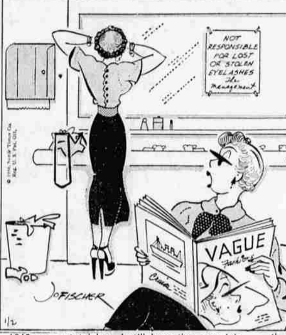
1949 was a total loss. I still have the same job... the same boy friend... and the same fur coat.