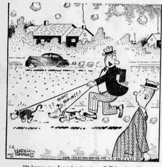
"It keeps me from having to pull Fido along!"