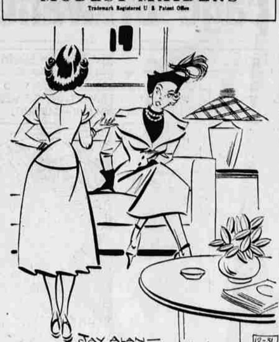
YOU WON'T CATCH ME GOING OUT ON NEW YEAR'S EVE TO A CROWDED NIGHT CLUB--NOT UNLESS I FINALLY GET A DATE.