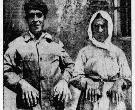
TWO PEOPLE, 28 FINGERS —This man and his wife have seven fingers on each hand, but that's not unusual where they live. In their village of Cervera de Buitrago, Spain, a five-fingered person is a freak. Almost every one of the 300 inhabitants has at least six fingers on one or both hands. Some have as many as nine. Close intermarriage and village restrictions that keep out settlers with the normal number of fingers produced this odd situation.