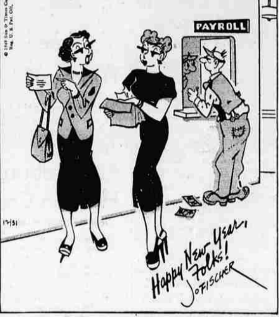
Every time I see my total earnings for the year, I think of how rich I could be if I didn't have to live.