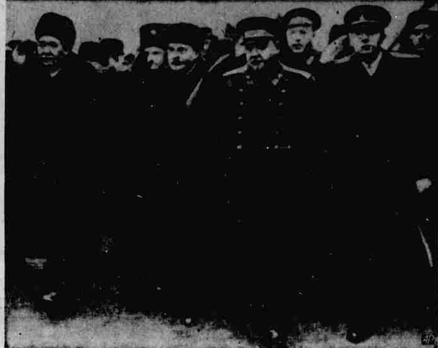
CHINESE RED CHIEF IN MOSCOW —Mao Tze-tung (left), military boss of Communist China, returns salute of honor guard on his arrival at Moscow airport. Awaiting Mao's arrival were, Soviet Prime Minister V. M. Molotov (second from left), Marshal N. A. Bulganin (second from right), and Deputy Foreign Minister Andrei Gromyko (right.) Reason for Mao's visit was not disclosed.