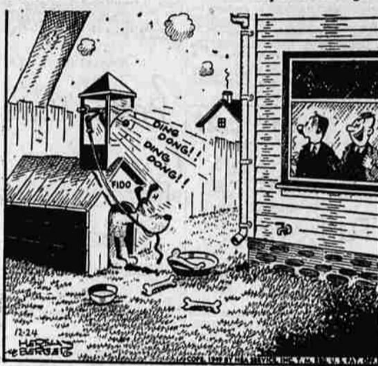
"I broke him of barking and taught him to ring when he wants something!"