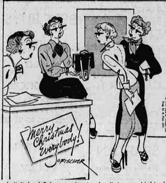
Isn't it lovely? I was going to give it to my girl friend for Christmas, but I liked it so much I fought with her instead