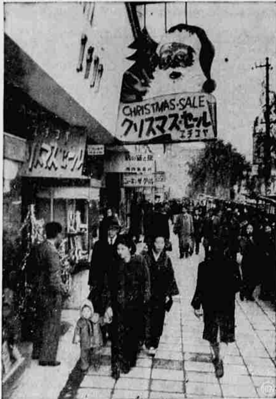
SANTA COMES TO TOKYO —Though only a small percentage of the Japanese observe Christmas, Tokyo's department stores do their best to give their stores a Yuletide atmosphere. To U. S. occupation troops and their families, this store's "Santa Claus" is a reminder of home.

The reflector parts are made of fluorescent cloth backed with leather. These are fastened in cross-shape over the front part of the headstall and in crescent shape over the back of the candle. Noack said the reflectors can be picked up by an automobile headlight beam a half mile away.