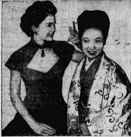
EAST AND WEST MEET —Esther Williams, motion picture star, admires a hair ornament worn by Kinuyo Tanaka, first lady of the Japanese screen, during a luncheon to the Oriental actress in Hollywood on a tour of United States.