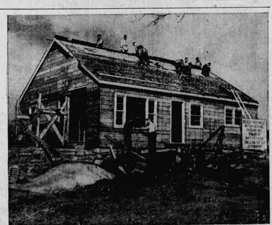
STUDENT PROJECT-Students in the building trades class of Raylown, Mo., High School, work on the six-room house with garage they are building as part of their class work.