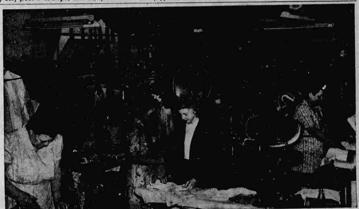
PIC. UKEU ABOVE are the girls and women in the finishing department at the New Service laundry on West Lane street. Uniforms and similar garments which pass daily through the Prosperity is to be seen everywhere; a closer look reveals it to be the name of much of the pressing equipment in use there. Southern Area Of California Hit By Freezing Spell