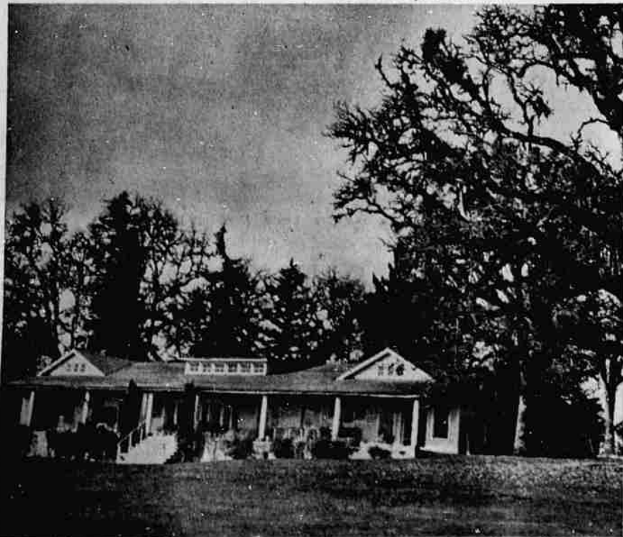
Roseburg Country Club