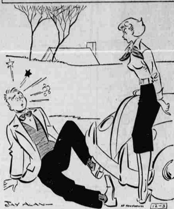
YOU SHOULD HAVE LOOKED AT THE SIGNALS ON THE BACK OF MY CAR AND YOU WOULD HAVE KNOWN I WAS GOING TO TURN RIGHT!