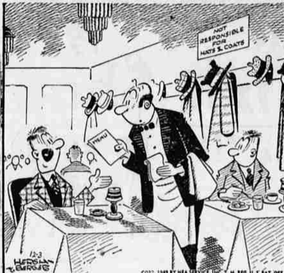
Nothing to eat—I just keep coming back to see if, by chance, I can get my hat back!