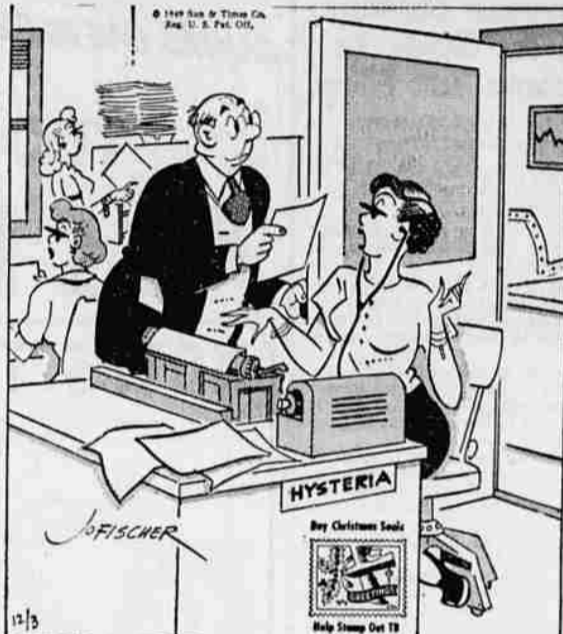
I know it says "yours only" 24th six times... but that's where the damn record got stuck.