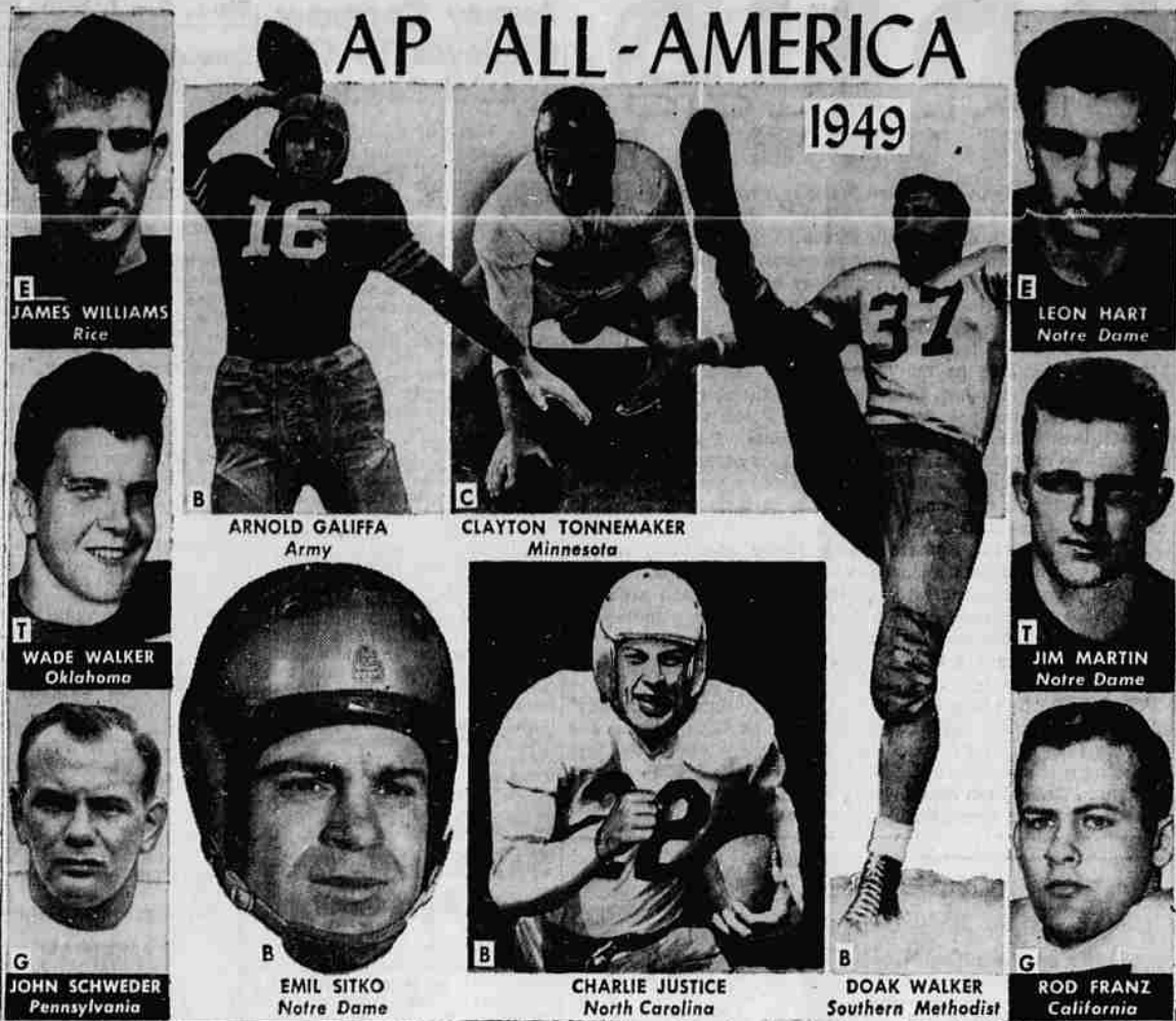
The nation's top four juggernauts—Notre Dame, California, Walker of Southern Methodist and Charlie (Choo Choo) Justice of North Carolina. This is the third straight All-America for Walker and the second for Justice. It makes the first time since prewar football that the entire team is made up of seniors.

The Romans are credited with introduction of the glass window.