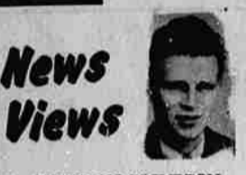
By SHERMAN PLIMPTON

Paris and New York designers are ganging up to put a little more sparkle into men's clothes. One French tailor says, "Man is in a state of vestimentary inferiority." We wonder if he'd like to step outside and say that. Mme. Schiaparelli burbles, "Men are dying to dress up, only they're afraid of being conspicuous." To help the shy lads out, the designers suggest raspberry linen slacks, black ski outfits with red scarves and green-laced boots, purple opera capes and alligator shoes with inch-high crepe soles. Well, we know a fellow who wears bright red suits... fellow named Santa Claus.