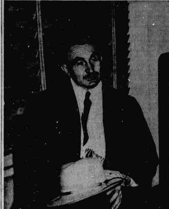
SENATOR WAYNE L. MORSE, speaking Tuesday before the Roseburg Kiwanis club, gave his views on the economic expansion possibilities of the United States.

WASHINGTON, Nov. 23.—(AP) Angus Ward, the American Consul General at Mukden, has been released from jail by the Chinese Communists and ordered out of the country. The Communists also released four Chinese aides who were jailed with Ward Oct. 24 on what the State department called "trumped up" charges of beating and insulting two Chinese in a wage dispute. The department announced today that it had received word of the releases from Ward himself. It was the first direct word from the Consul General in 11 months. In winding up what the department has denounced as their "barbaric" treatment of Ward, the Communists gave him a trial before the "people's court." This court found them all guilty and meted out varying prison sentences. Then the sentences were commuted to deportation. All Five Up and About Ward, 56-year-old veteran diplomat, made his report in a telephone conversation with American Consul General O. Edmund Clubb at Peking. Clubb rushed the information to Washington. Ward said that the other four (Continued on Page Two)