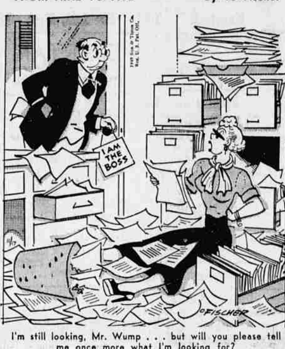
I'm still looking, Mr. Wump... but will you please tell me once more what I'm looking for?