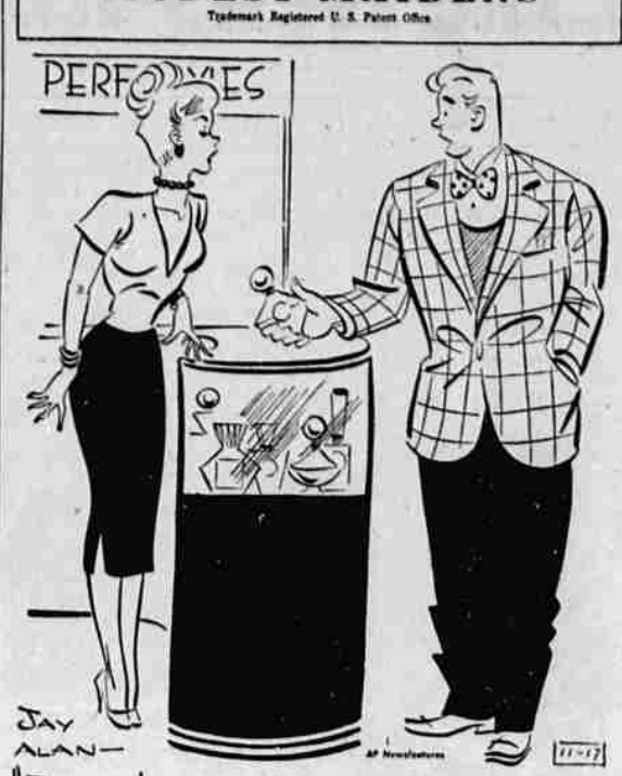
THAT ONE'S FORTY DOLLARS --- AND YOU GET A NICKEL BACK ON THE BOTTLE.