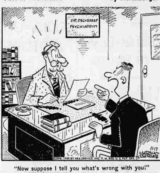
"Now suppose I tell you what's wrong with you!"