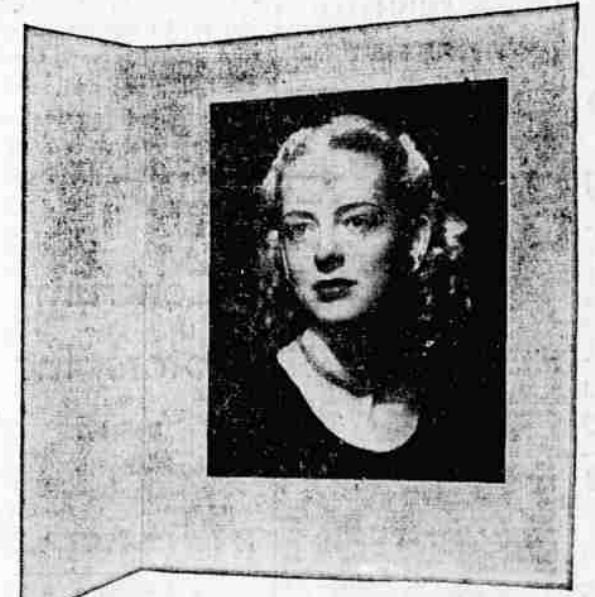
AN ADVERTISER'S DELIVERY

New and Used Machines. All machines and repairs guaranteed. Hemstitching, Buttonholes, Buttons and Belts made to your requirements. Sewing Machine Center 142 N. Jackson Phone 689-Y