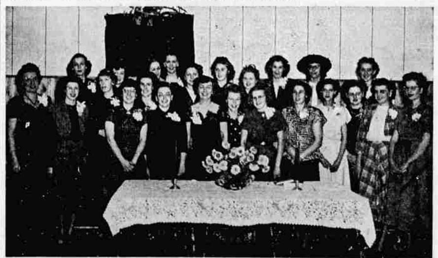
Pictured above are new initiates and several officers of the Roseburg Junior Woman's club after the ceremony held in the Eagles lodge assembly room Monday, Nov. 8.